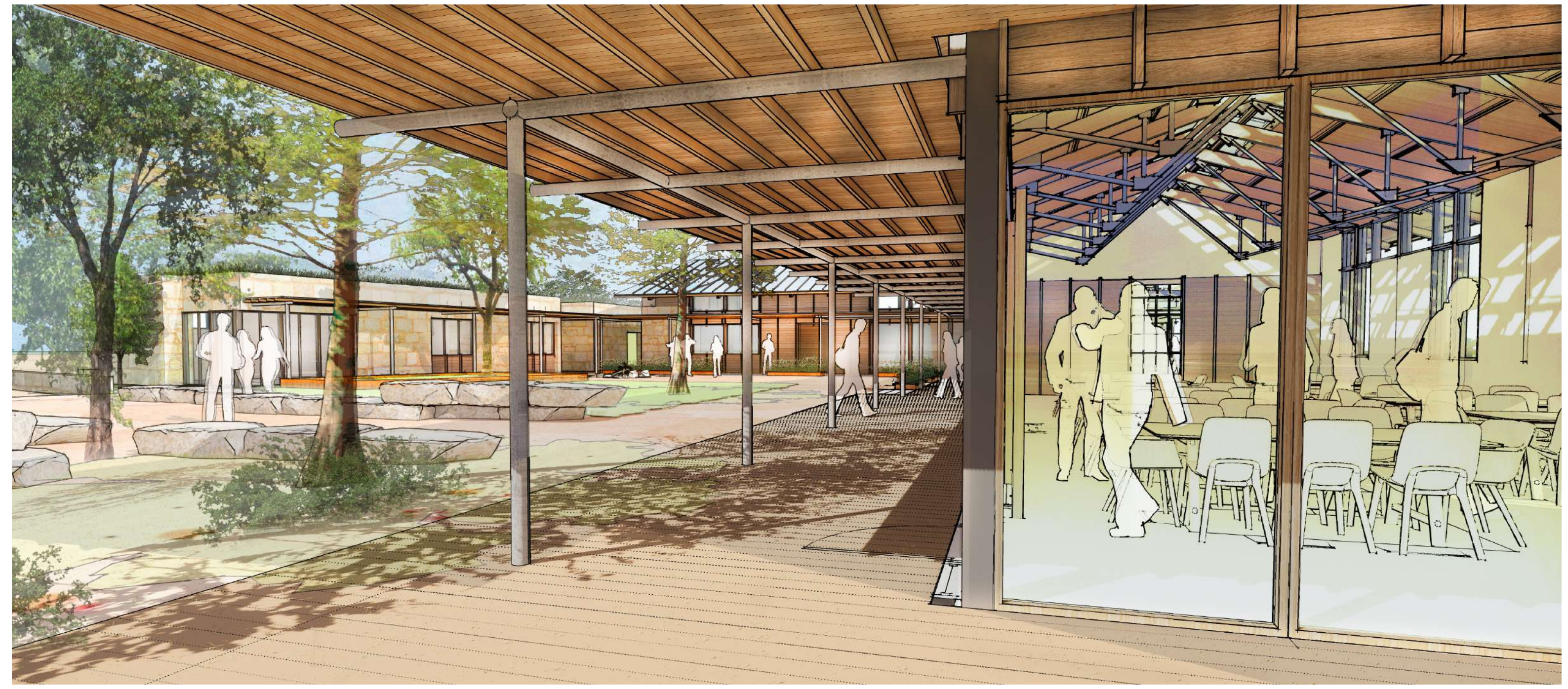
PERSPECTIVE VIEW FROM PORCH AT CLASSROOM WING