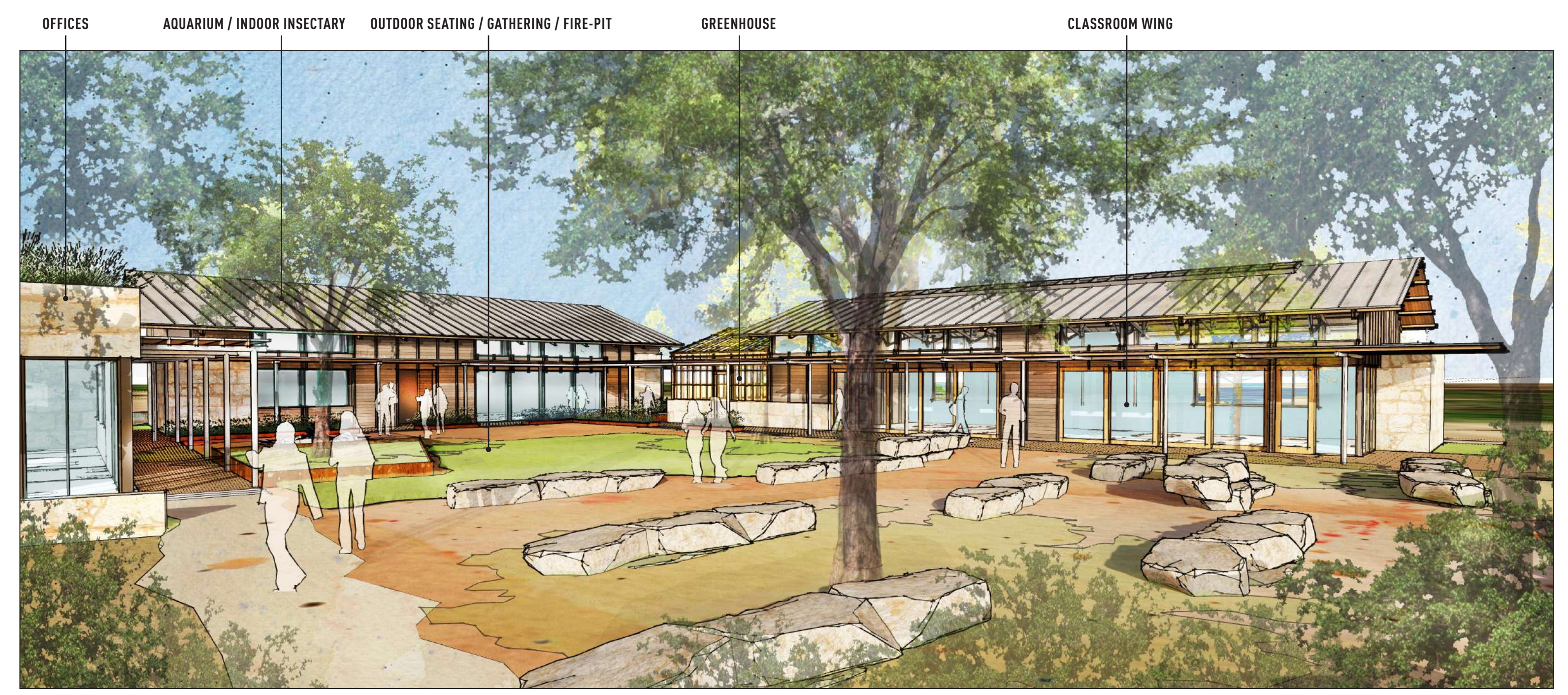
PERSPECTIVE VIEW AT INTERIOR COURTYARD