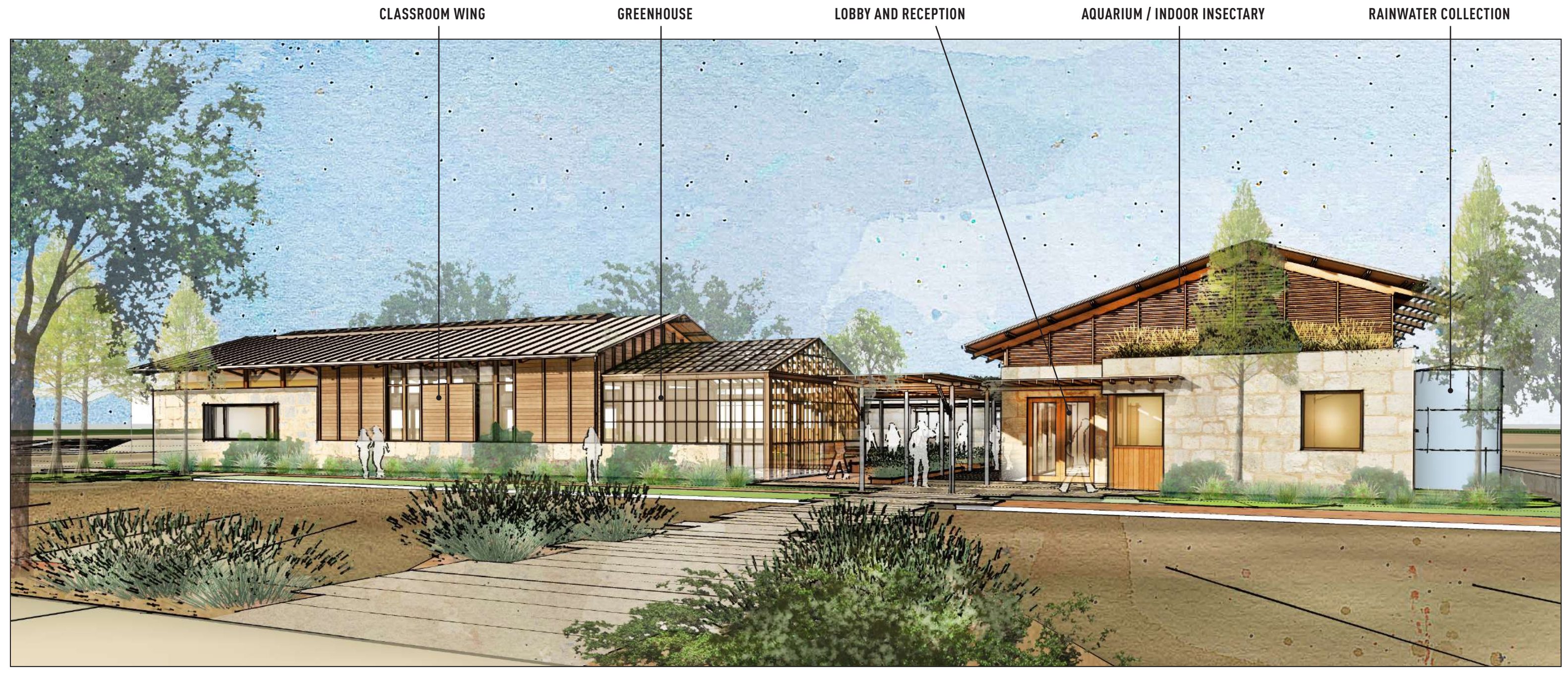
PERSPECTIVE VIEW AT ENTRY TO NATURE CENTER